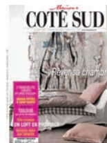
Maisons Cote Sud