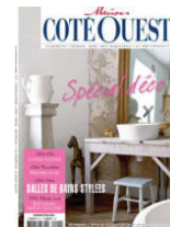
Maisons Cote Quest