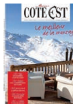
Maisons Cote Est