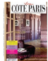
Vivre Cote Paris