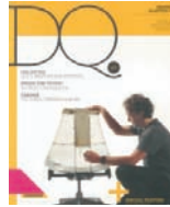
DQ (Design Quarterly)