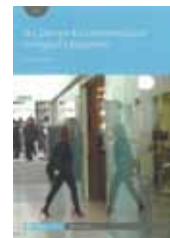
Art, Design & Communication in Higher Education