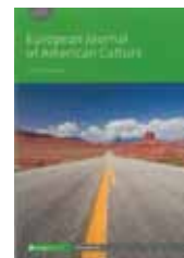
European Journal of American Culture