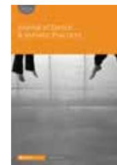
Journal of Dance & Somatic Practices