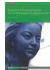
Empedocles: European Journal for the Philosophy of Communication