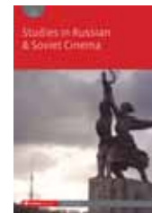
Studies in Russian & Soviet Cinema