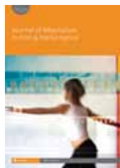
Journal of Adaptation in Film & Performance