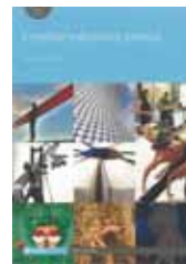
Creative Industries Journal