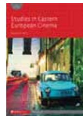
Studies in Eastern European Cinema