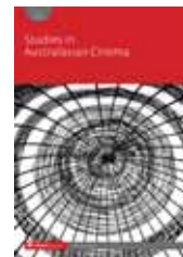
Studies in Australasian Cinema