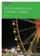
The Canadian Journal of Popular Culture