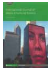
International Journal of Media & Cultural Politics