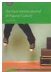
The Australasian Journal of Popular Culture