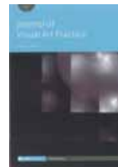
Journal of Visual Art Practice