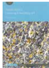
Visual Inquiry: Learning & Teaching Art