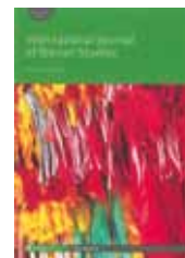
International Journal of Iberian Studies