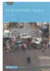
Art & the Public Sphere