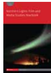
Northern Lights: Film & Media Studies