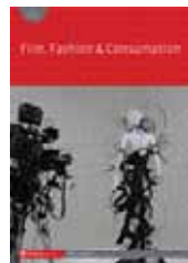
Film, Fashion & Consumption