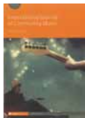
International Journal of Community Music